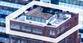
450 WEST 31 ST STREET